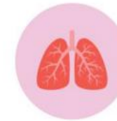
Chronic Respiratory Diseases