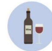
Harmful Use of Alcohol