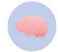
Mental health and neurological disorders