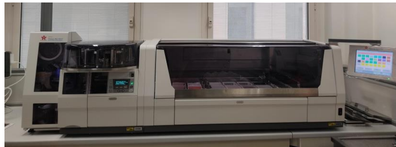
Digitalisation | Digitalisation of the Pathology Department € 2.2 million