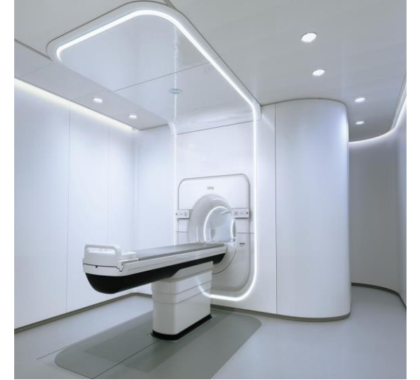
Digitalisation | Procurement of an MR Linac € 9.4million