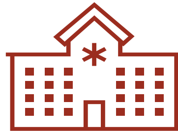
ERDF.08.022 | Paola Primary Health Care Southern Regional Hub € 29.8million