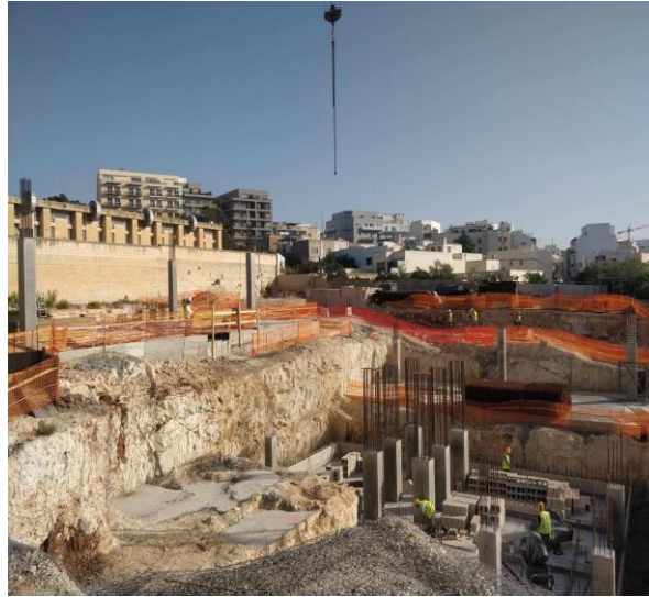
Blood Bank | Establishment of a Blood, Tissue and Cell Centre € 25million