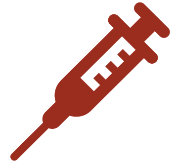
ERDF.08.990 | Provision of Support to the National Health System to Mitigate the Risk Factors due to COVID-19 Pandemic € 19million