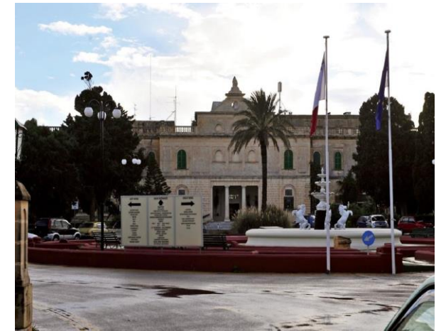
Mount Carmel Hospital | Investment in Renovation & Deep Retrofitting € 12.2million